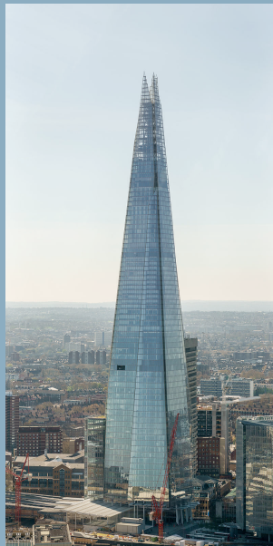
Burj Khalifa, Dubai (left) and the Shard, London (right).

Why do you think the Burj Khalifa in Dubai was built?