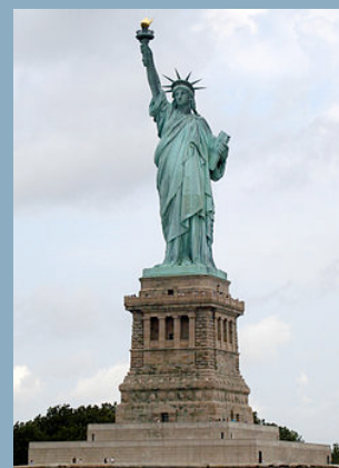
Nelson's Column (London), Monument to the Women of the Second World War (London), the Statue of Liberty (New York).

What is a monument? Is it different to a building?